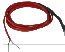
ACG4666 PROBE for PARK 230V to keep the motor warm (for prompt start at low temperatures)