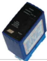
ACG9064 METALLIC MASS DETECTOR to open with vehicles 2 channels - 12÷24 Vac/dc