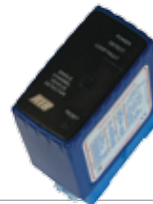
ACG9063 METALLIC MASS DETECTOR to open with vehicles 1 channel - 12÷24 Vac/dc