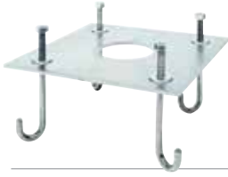
ACG8110 BASE PLATE