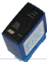
ACG9060 METALLIC MASS DETECTOR to open with vehicles 1 channel - 230 Vac