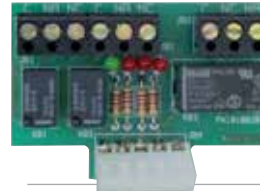
ACQ9081 3 Relay Card to manage courtesy light, traffic light, electromagnetic lock with PARK 230V