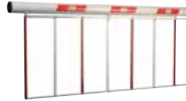
ACG8290B HANGING RACK L=2m Real lenght 1,63m